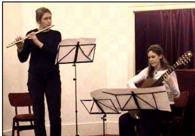
The Hepworth Ensemble