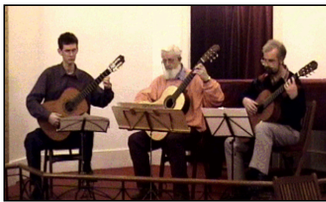
'The Earl of Sussex' Trio