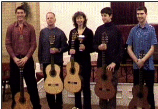
The Senior Recital Class