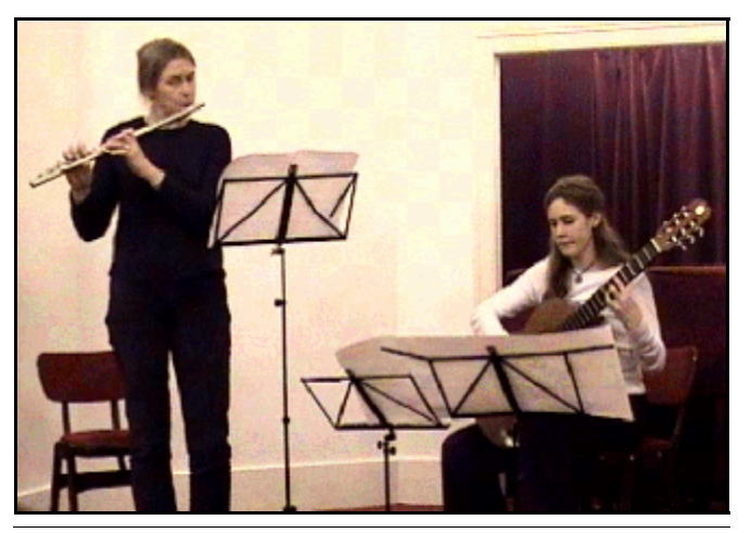
The Hepworth Ensemble