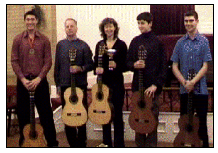
The Senior Recital Class