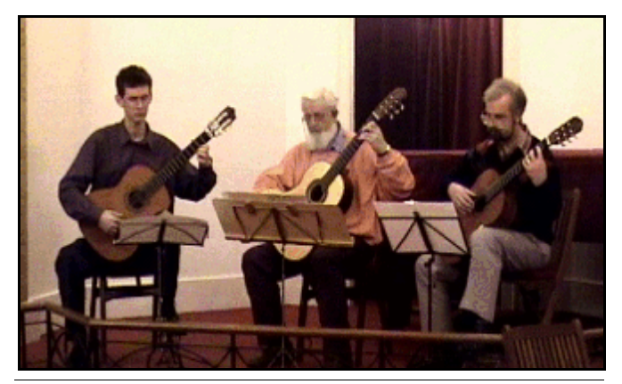
'The Earl of Sussex' Trio