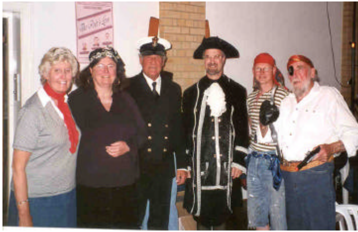
A Motley Crew