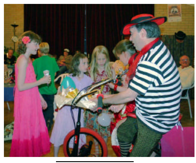
Just One Cornetto