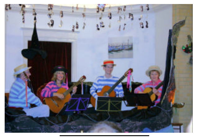
Gala Quartet Afloat