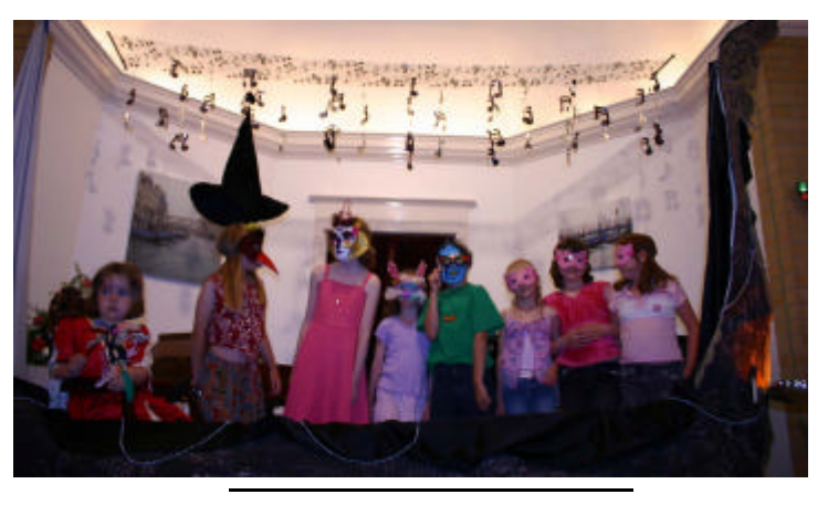
Children's Venetian Masks