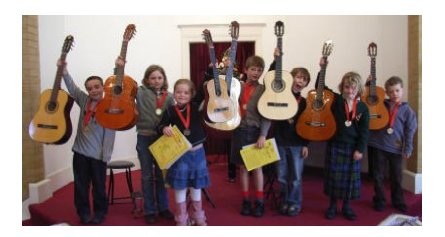
Novice Age 9 and under