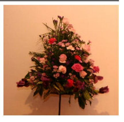
Some of the club floral displays from award winning Town Flowers