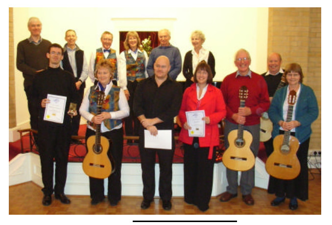
The Duet Class