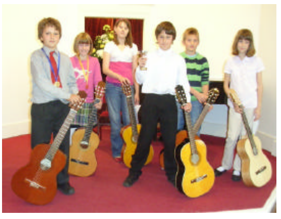
Solo under 12, above grade III