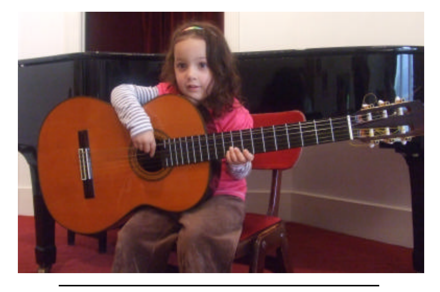
Tigerlily, the youngest to take to take the stage