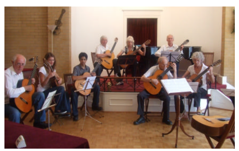
Regis Guitars warm up