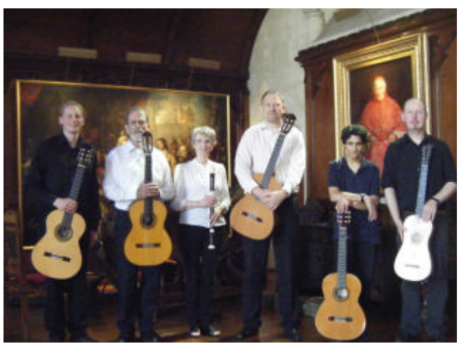
The Performers at Arundel Castle