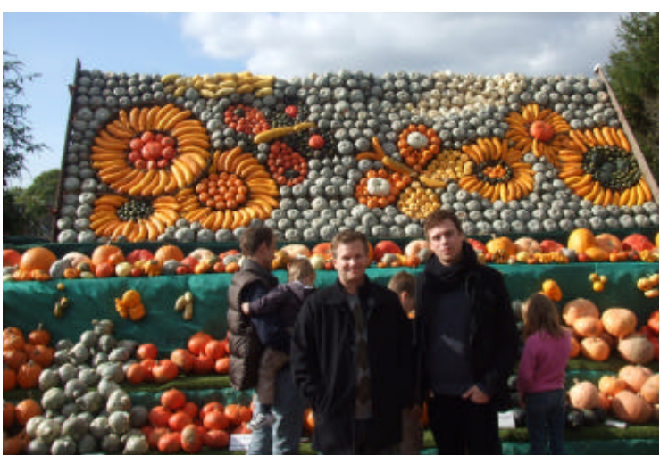
The Duo Visit Slindon Pumpkin Farm