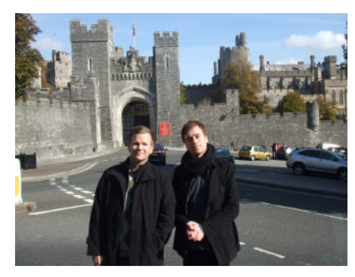
Sightseeing at Arundel