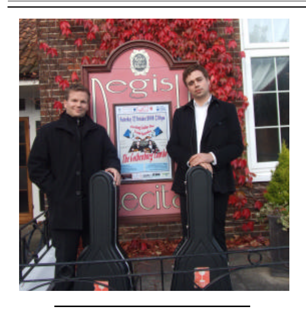
The Gothenburg Combo arrive