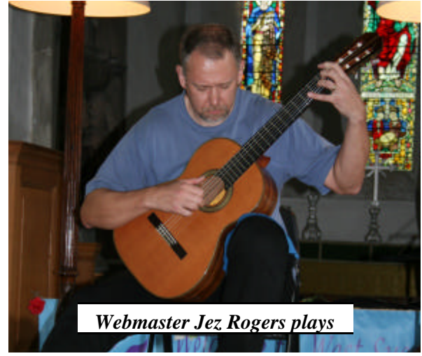
WSGC at West Dean Open Day 21st Aug 2011