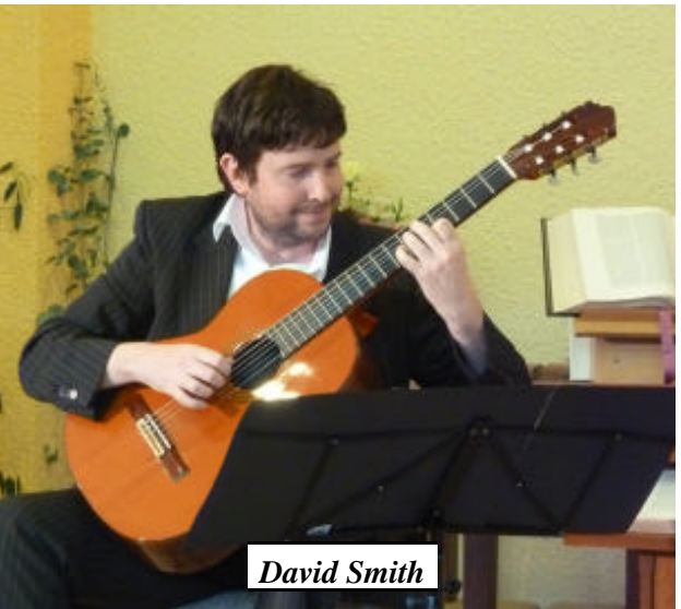
WSGC at Christ Church Chichester 25th Sept 2011