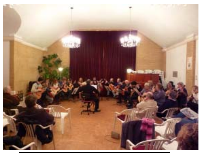
The Guitar Orchestra outnumber the audience!

People often change their internet provider, but forget to tell the WSGC. Do we have your correct latest e-mail address? We can then notify you should there be any useful information or (very rarely) late changes to our concerts or club evenings. Also, don't forget to tell us if you change your home address or telephone number.