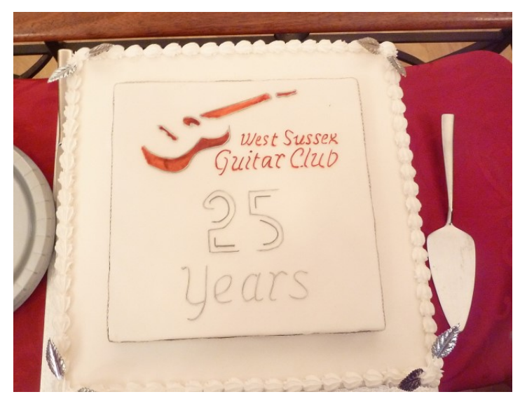
Shelly Bobak's delicious cake