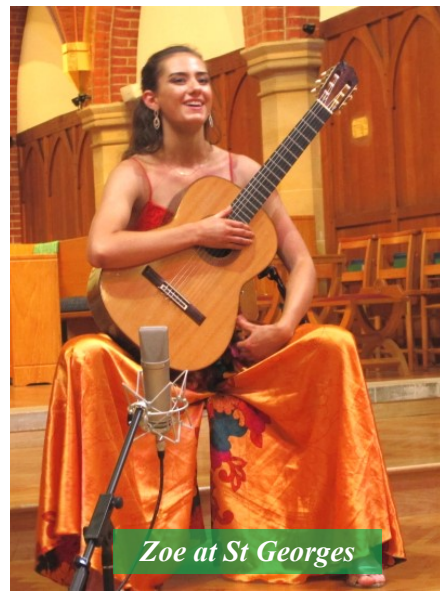
Festival of Chichester 2019